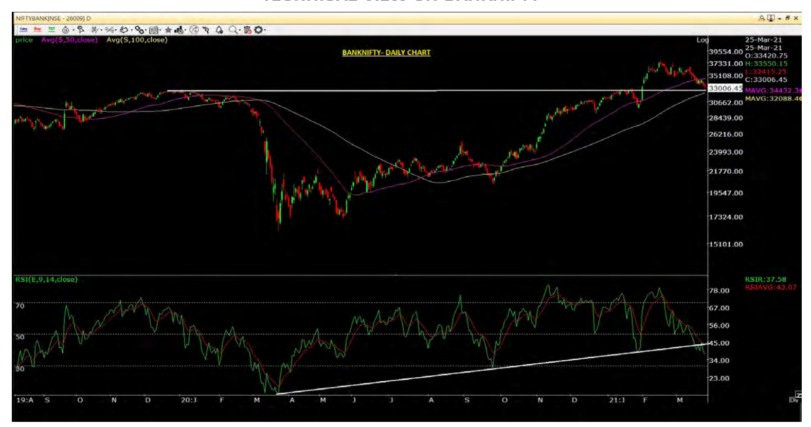
BankNifty - Daily chart