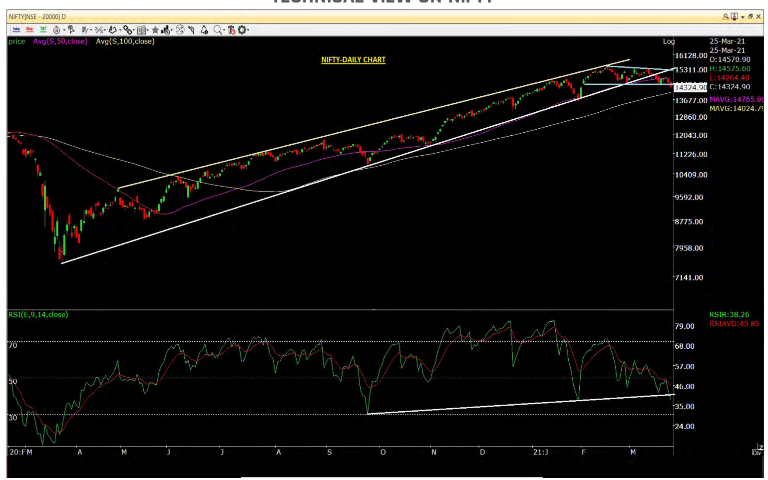
NIFTY 50 - 25-MAR 2021 DAILY CHART