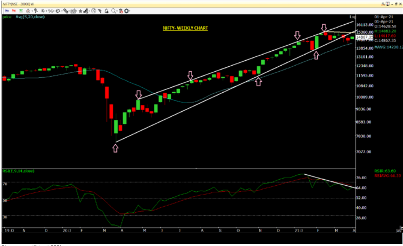
Chart as on 1<sup>st</sup> April 2021