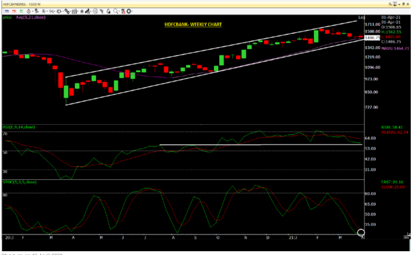
Chart as on 1<sup>st</sup> April 2021