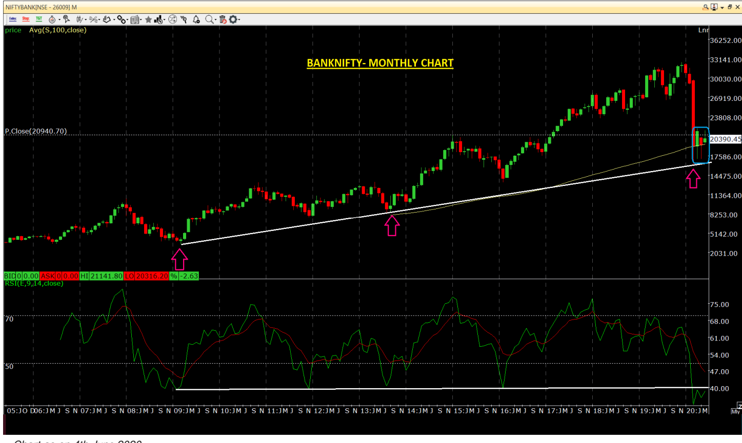
Chart as on 4th June 2020