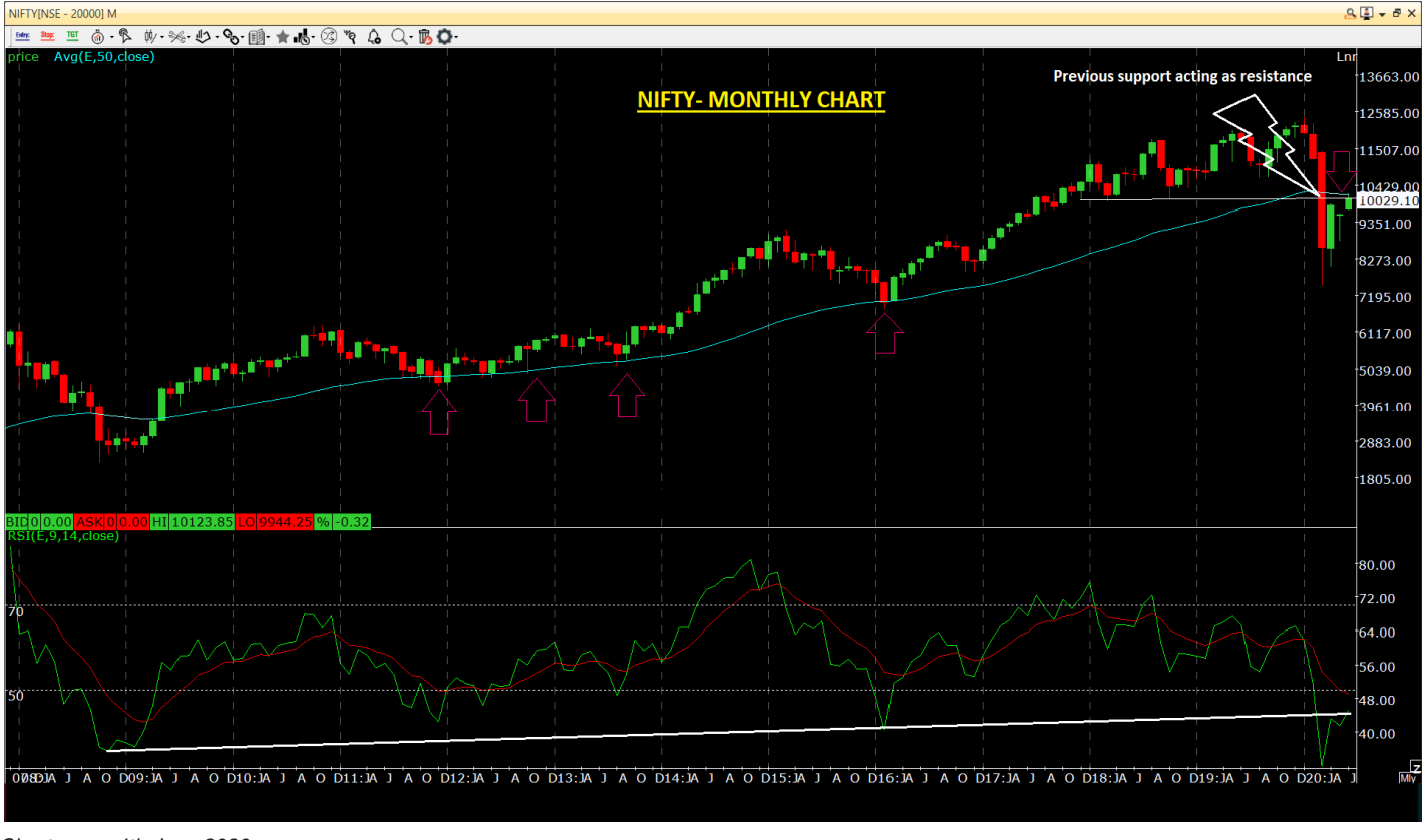
Chart as on 4th June 2020