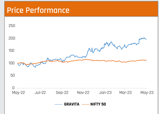
Rebase to 100