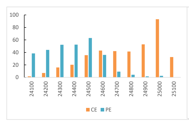
Nifty Option OI - 18 July (OI in Lakhs)